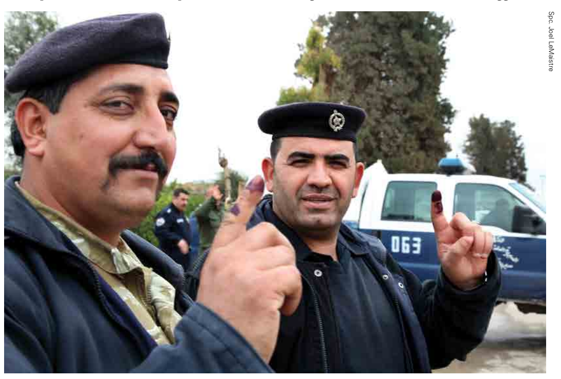
Iraqi policemen near a polling site lift their inked fingers to show they voted, Arapha, Iraq, March 4, 2010. Iraqi security forces were given the opportunity to vote early to assist in providing security on election day.

As the vicious cycle of de-legitimation gathered momentum, Bremer's external agenda and then the agendas of the Iraqi Interim Government (2004-05) and Iraqi Transitional Government (2005-06) became more difficult to impose. As Herring and Rangwala noted in 2007, "these struggles are